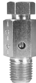
Tapered Pipe Thread

The Lenz Air Bleeder Valve is an exclusive design, extremely compact and consisting of only two metal parts. No packings are employed. The fact that it is necessary to eliminate all air from lines and equipment in order to maintain maximum operating efficiency makes this valve an important and vital part of the hydraulic system. It needs only to be installed at the highest point in the circuit where the air accumulates. It is especially needed when starting a hydraulic system. Easily installed.