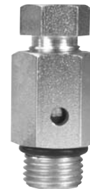
SAE Straight Thread

Note: When Ordering Lenz Air Bleeder Valves in Stainless Steel Add -SS. Example: 4ABV-SS.